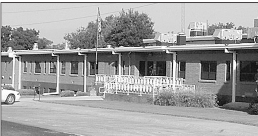
Cheyenne County Hospital

785-332-3172 U.S. Highway 36, St. Francis