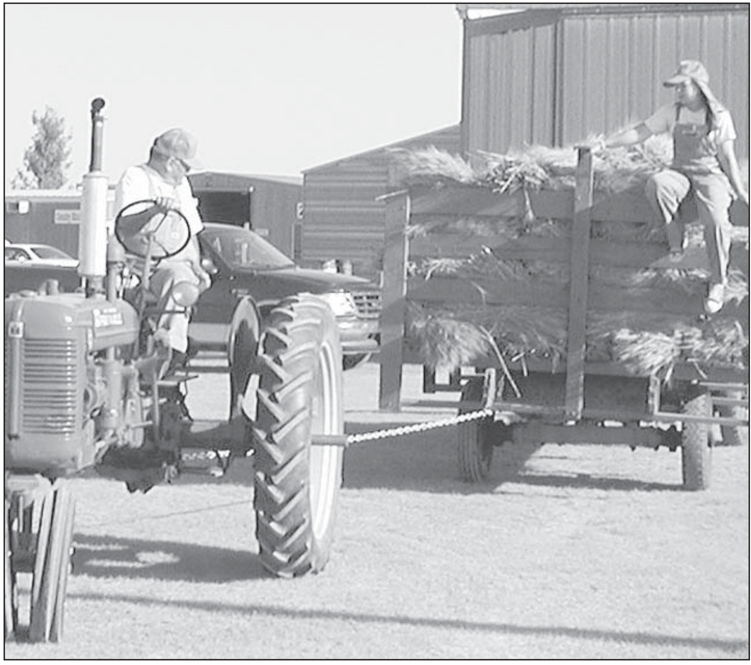
WHEAT IS PULLED FROM one of the buildings at the Thresher Show Grounds to be taken to the display area and separated. Large crowds viewed a variety of events at the 51st Show.