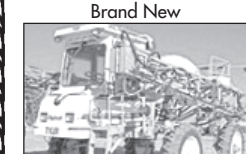
1997 Tyler Patriot XL

Netwrap round baler w/Xtra sweep, only 1200 bales. Like Brand New