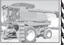
1995 1688 Case IH

tractor FWA, 4 sp/2 sp hi-low trans. 18.4x38R duals, 3 pt. 3 hyd. air-ride seat, 6645 hrs. VERY GOOD.