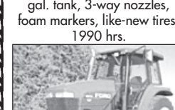
1995 8870 Ford Tractor

sprayer w/90' booms, 750 gal. tank, 3-way nozzles, foam markers, like-new tires, 1990 hrs.