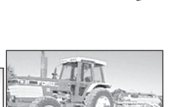
1987 TW 35 Ford

bi-directional w/7614 New Holland loader & grapple, loaded, 900 hrs. LIKE NEW