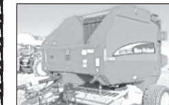
2005 NH BR 780

Netwrap round baler w/Xtra sweep, only 1200 bales. Like Brand New