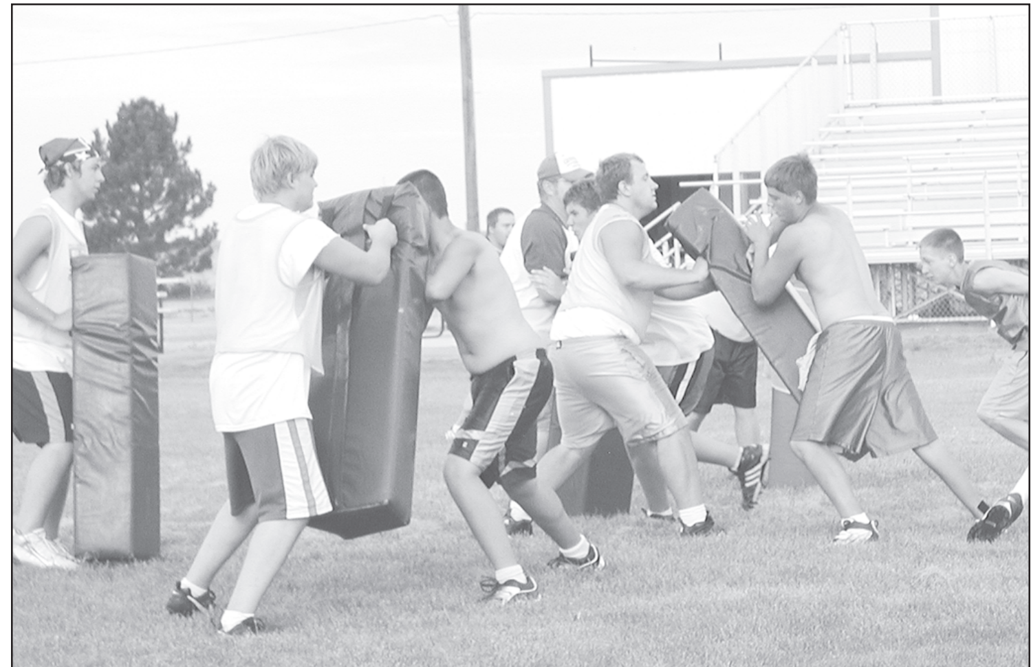
FOOTBALL PRACTICE — The boys have been getting home against Hitchcock County. ready for their first game. The first game will be Sept. 1 at

Hoxie could not field a full team, and Benkelman Country Club did not compete due to prior commitments.