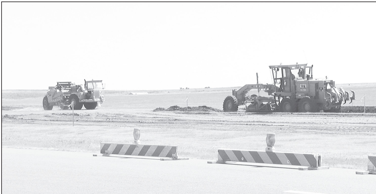
TUESDAY was the start of the dirt work for the construction of the apron which will allow for more parking area for planes.

He said that most of the cuts in staff will be through retirement or "attrition." The present staff in offices to be cut will either need to move or travel, however, they will still be making the necessary field visits.