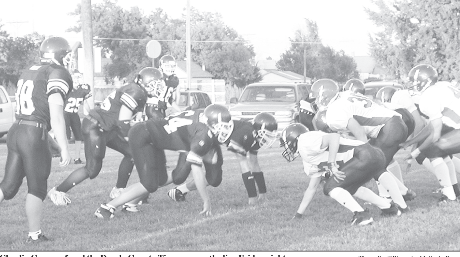
Cheylin Cougars faced the Dundy County Tigers across the line Friday night.

This week the Cougars travel to Tribune on Friday, Sept. 22.