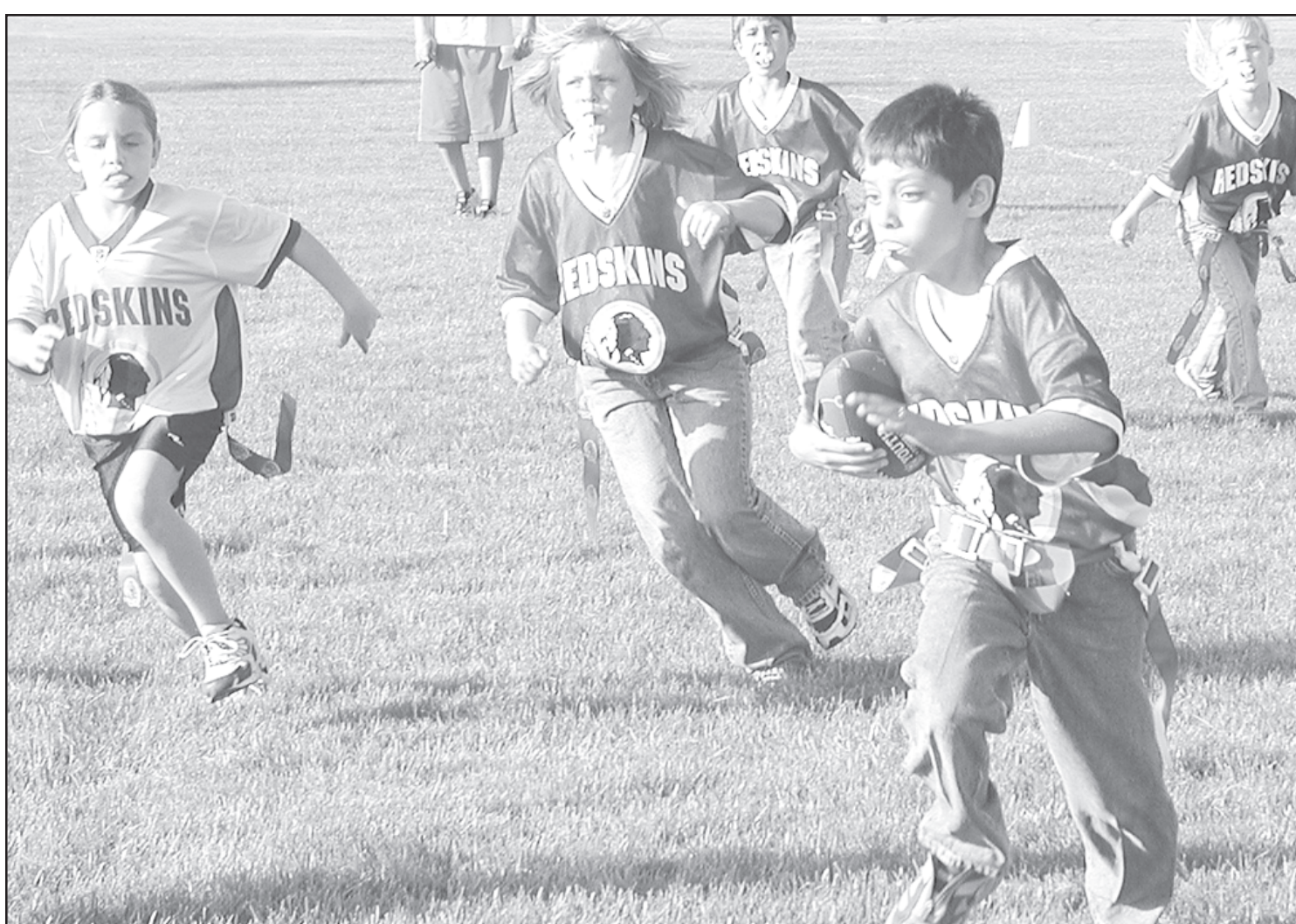
KIDS FLAG FOOTBALL marks the beginning of the school year along with the fall season. The season for the Cheylin kids

The next meeting will be 7 p.m. on Nov. 6w.