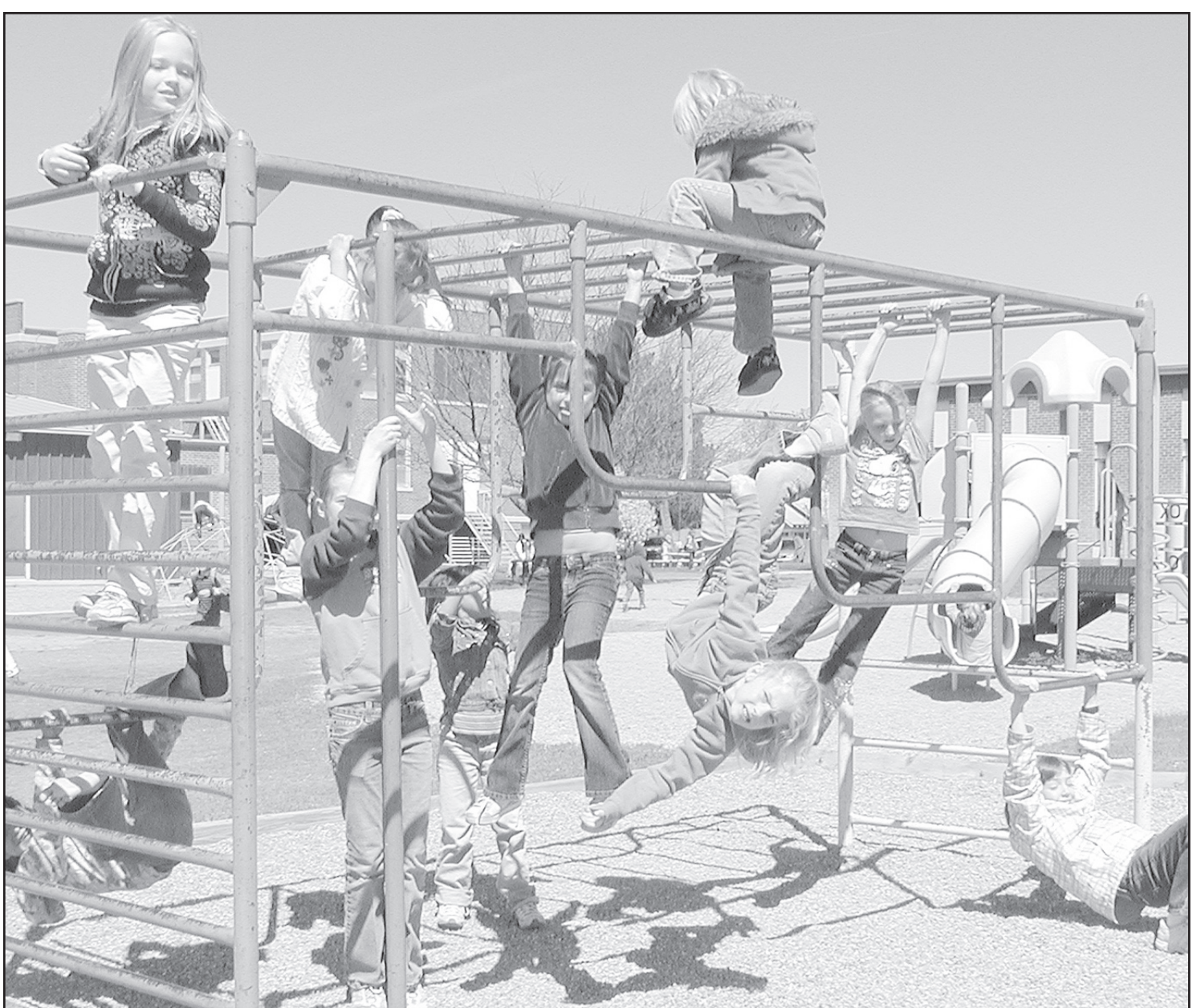
STUDENTS TAKE ADVANTAGE of the weather and enjoy the playground equipment.

Inserted in this week's issue of the Bird City Times and The Saint Francis Herald is the graduation special section. Seniors and their plans are featured in the section. It was brought to readers by businesses and parents. It would not be possible without the cooperation of the school employees.