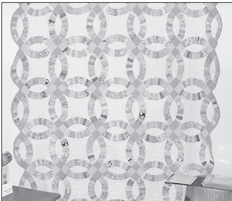
WEDDING RING QUILT by Martha Zwegygart is on display at the library.

Everyone is urged to stop in and see the displays at the library.