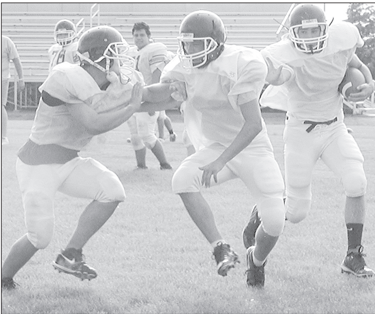
PRACTICING IN PADS. Members of the Cheylin football squad go through the drills. The Cougars open the season at home against Wauneta-Palisade on Friday, Sept. 3.

The commission will meet again on Aug. 18 at 6 p.m. in the high school library.