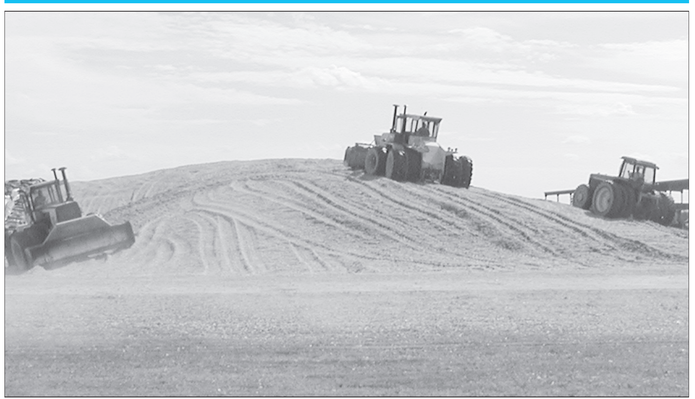
PACKING SILAGE — Dairy workers are busy packing the chopped corn to feed to the cows through out the winter months.