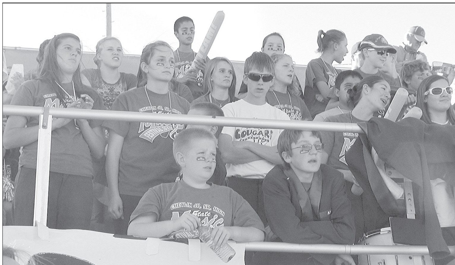
COUGAR FANS WERE OUT IN FULL FORCE on Saturday to cheer on their team.