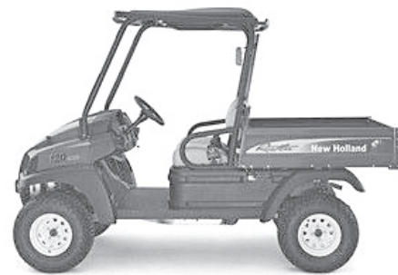
New Holland Rustler 125

She'll be anxious to use it to Fix Fence!! She can also use it to get the mail!