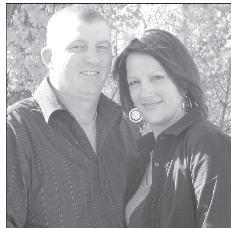
Sharp — Verde