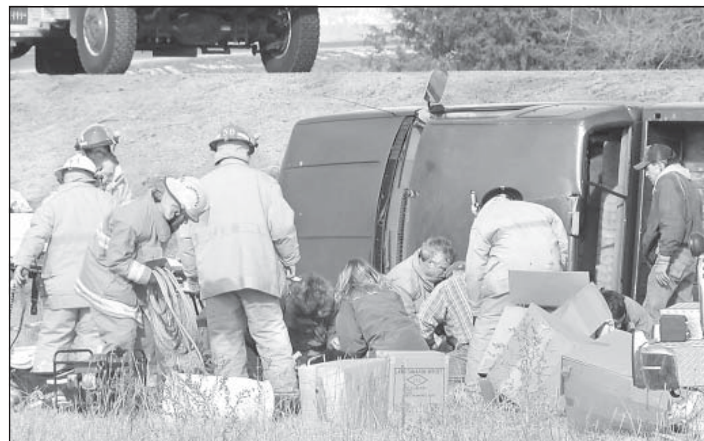
Ambulance crew members helped a passenger in a one-vehicle accident Tuesday afternoon at the junction of U.S. 36 and K-383. Assisting at the scene with extraction equipment were members of the Norton Fire department. The sheriff's department directed traffic.