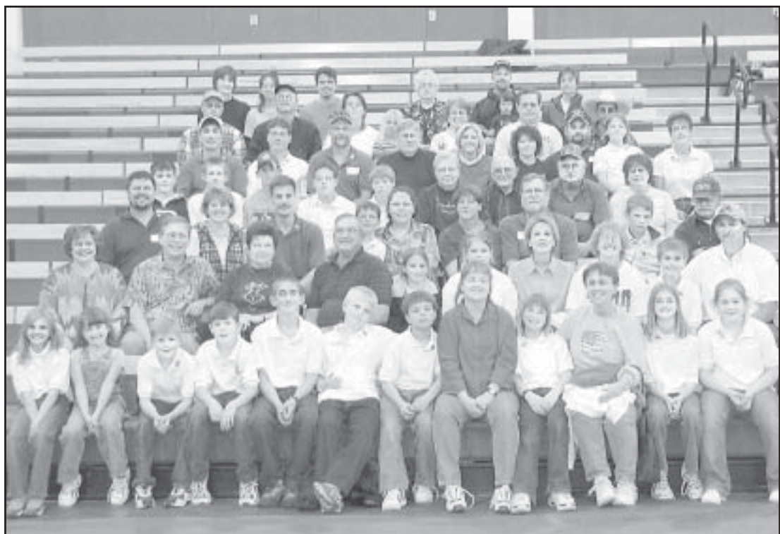
Norton County BB Gun Team fans are the best! Whenever a BB Gun Shoot is held — state or international — the Norton teams always receive the best fan support. Last Saturday was no exception as a very large crowd traveled to Alma where three Norton County BB Gun teams were competing in the Kansas State Jaycees BB Gun Championships.