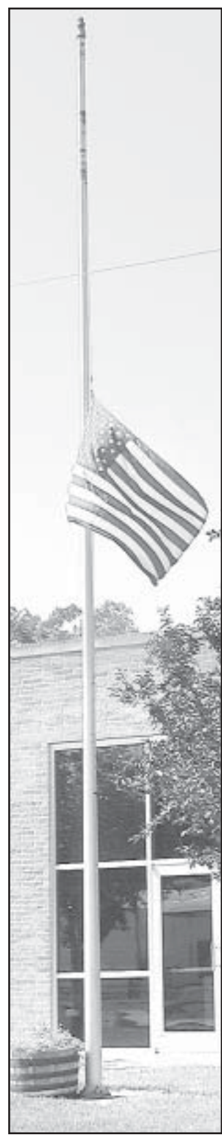
Norton mourned with the rest of the country at the death, Saturday, of Ronald W. Reagan (1911-2004), the 40th president of the United States. Flags flew at half-mast this week at the Norton City Hall and other buildings throughout the country.