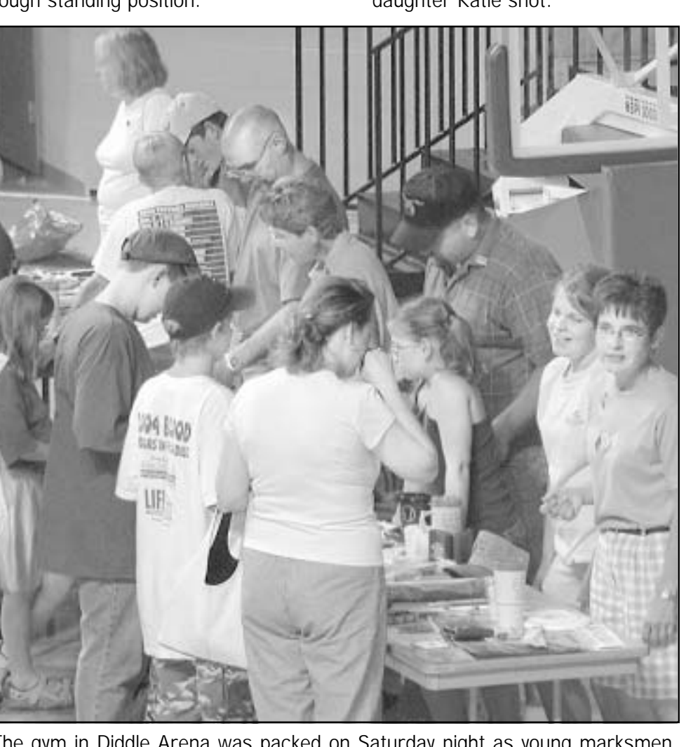
The gym in Diddle Arena was packed on Saturday night as young marksmen, parents and coaches became better acquainted by swapping state souvenirs.