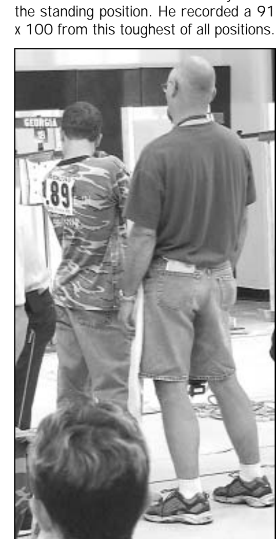
prepares to fire another round from the standing position.