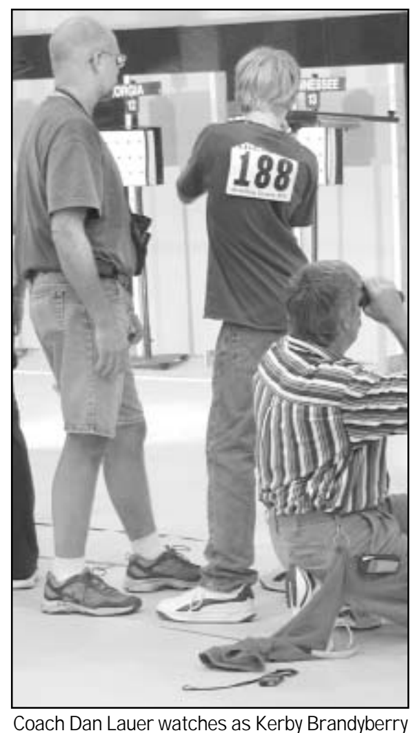
competes from the standing position.