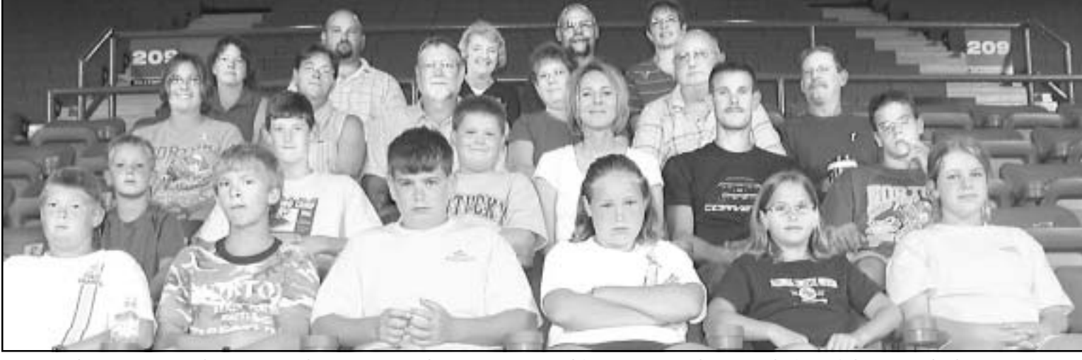
NORTON CONTINGENT — The Norton shooters, coaches, parents and fans pose at the completion of the Awards Ceremonies on Sunday evening. Norton follows the BB Gun Team wherever they shoot and always has the largest number of boosters