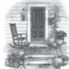
MEMBERSHIP DRIVE AND HOMES TOUR