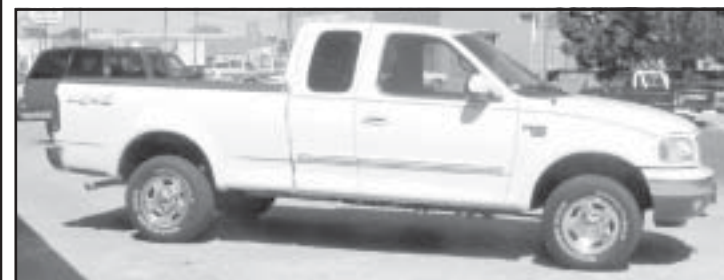
2002 FORD F150 4 DOOR SUPER CAB — XLT trim, 5.4, V-8, 4X4, trailer tow, an exceptionally clean pickup, 22,000 miles.