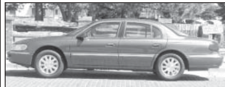
2001 LINCOLN CONTINENTAL — 4 door with all the luxury equipment, immaculate, 52,000 miles. 1999 GMC YUKON — Top of the line 4 door, heated leather seats, CD, full power, very clean, 57,000 miles. 1997 CHEV. TAHOE — Nice clean SUV, 4X4, leather, GREAT BUY, 118,000 miles. 1994 CHEV — It's the popular General Motors 4 door Suburban, 4X4, very clean, 153,000 miles. Lots of vehicle at a great price! 1995 FORD TAURUS — 4 door, only 46,000 miles, full power, very nice.

Or Choose from many Other Wise Buys in Cars — SUVs — Vans