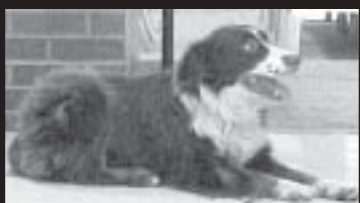
GIZMO 3-4 yr. old male