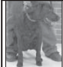
"Maggie" 1-2 yr. old female Black Lab Mix

For more information contact Linda Terrell, 877-5219