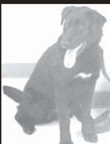
"Bear"—1-2 year old female Black Lab Mix

For more information contact Linda Terrell, 877-5219