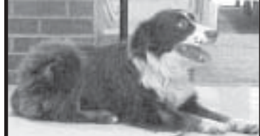
Red Australian Shepherd