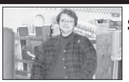
The Sewing Box