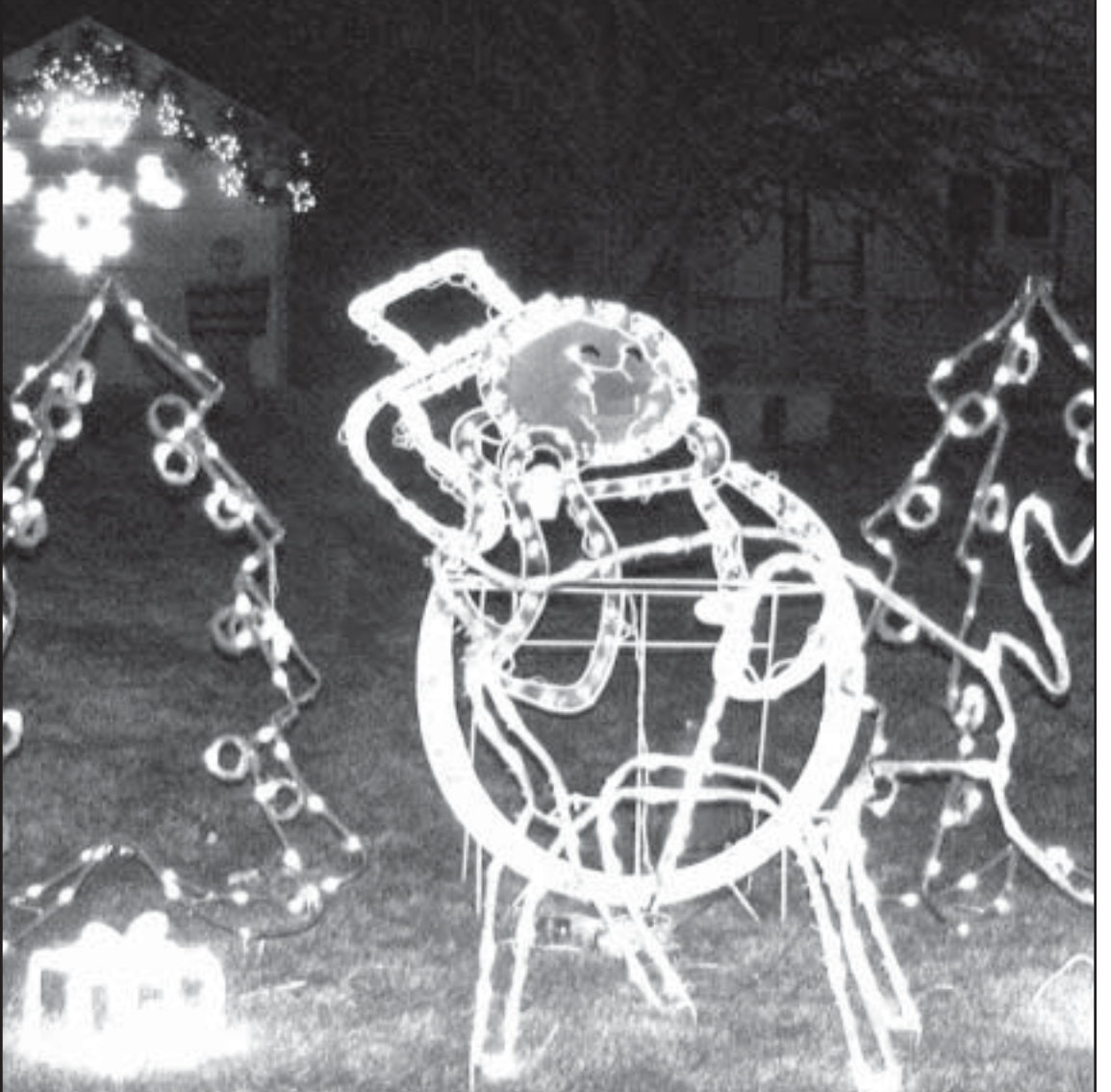
Reindeer, snowmen, Santas and candy canes can be found glowing on or around peoples' homes in Norton. Santa is sure to find the chimneys in Norton... all he has to do is follow the bright lights.