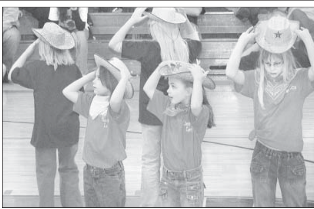
Northern Valley's dance team members held a little girls' dance camp and the young ones performed at the game on Saturday.