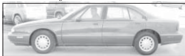
1999 OLDS 88 LS — Crimson red, tan leather interior, PS, local one owner, looks like new, 63,000 miles ..... $7,900