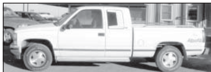
1996 CHEVROLET EXTENDED CAB — 1/2T, 4X4, PS/PW, white, 91,000 miles ..... $9,995