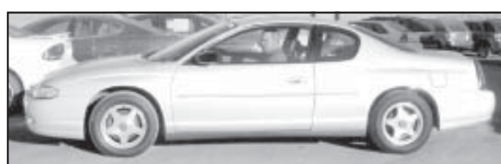
2004 PONTIAC MONTE CARLO LS — CD, aluminum wheels, silver, bucket seats, GM Program Car, 18,000 miles ..... $11,500