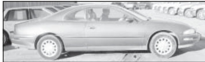
1995 BUICK RIVIERA COUPE — Polo green, leather buckets, all the toys, 92,000 miles ..... $4,995