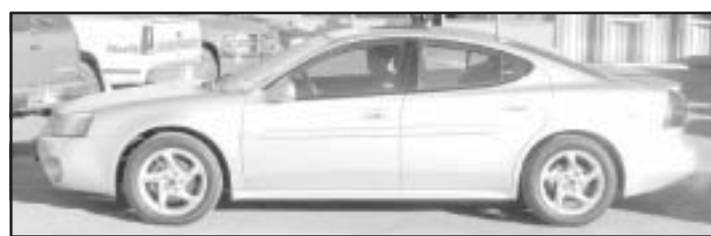
2004 PONTIAC GRAND PRIX GTP SUPER CHARGED — PS/PW, moon roof, aluminum wheels, silver, 15,000 miles ..... $17,400