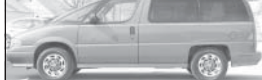
1995 CHEVROLET LUMINA MINIVAN — LT trim, lots of extras, very clean, only 50,000 miles and won't cost you a lot of money.