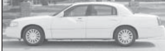
2003 LINCOLN TOWN CAR — Signature Series w/premium equipment package, adjustable pedals, heated seats, memory seats, reverse warning system, and more! 19,000 miles on this gorgeous luxury sedan.