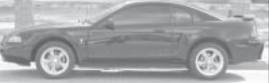
2004 FORD MUSTANG — V-6, rear spoiler, alloy wheels, a real beauty in jet black, 19,000 miles. And a 2000 MUSTANG CONVERTIBLE — Hard to tell it's not new! Loaded, metallic red, 36,000 miles.