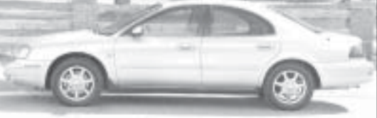
2002 MERCURY SABLE LS — Premium package, 24 valve engine, moon roof, keyless entry, automatic temperature control, and more — only 15,000 miles.