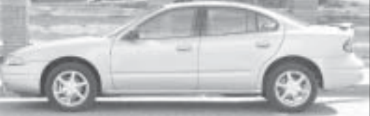
2002 OLDSMOBILE ALERO — 3400 V-6, CD, traction control, moon roof, rear spoiler, gorgeous 25,000 miles. And we also have another 2002 in a sporty 2 door — some equipment, only 29,000 miles.