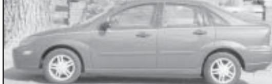
2003 FORD FOCUS SE — Lots of extras, metallic red with 5-speed overdrive, 6,600 miles. Have a 2002 also in stock, with only 13,000 miles and an automatic transmission.