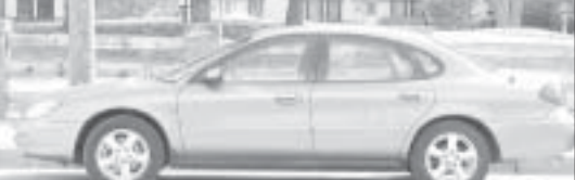
2002 FORD TAURUS SES — Leather, moon roof, CD, full power, exceptionally clean, 30,000 miles. Or one more with 42,000 miles.

AND COMING IN — WOW! LIKE NEW LINCOLNS AT GREAT SAVINGS! 2002 LINCOLN LS — Sport equipment package, ivory parchment tricoat metallic, 5,700 miles. 2003 LINCOLN TOWN CAR — Cartier Series in ivory parchment, tricoat metallic, 7,600 miles. 2003 LINCOLN TOWN CAR SIGNATURE SERIES — In pearl white metallic, 7,500 miles.