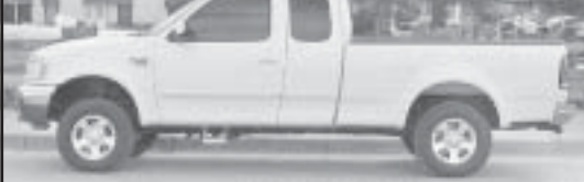
2003 FORD F150 SUPER CAB — 4 door, 4x4, 4.6L, V-8, only 19,000 miles, like new. We also have a 2004 with 5.4L, V-8, off road package, double sharp, 16,000 miles.