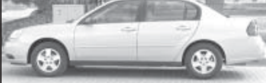
2004 CHEVROLET MALIBU — Upgraded LS model, CD, traction control, 3.5 L, V-6, metallic beige, 12,000 miles.