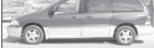
2004 FORD WINDSTAR SEL — 4 dr., power sliding, quad seating, leather, rear air, reverse warning system, gorgeous matador red w/silver twotone, 72,000 miles, great price. Also have a 2001 Windstar with only 28,000 miles.