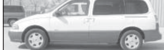
2002 MERCURY VILLAGER — Sport trim, quad captain chairs, rear air, CD stacker, like new with only 30,000 miles.