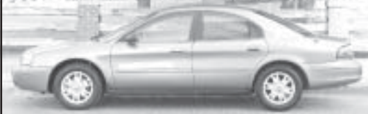
2004 MERCURY SABLE — Full power, cast aluminum wheels, only 11,000 miles. And we have the same car in a 2003, extra clean.