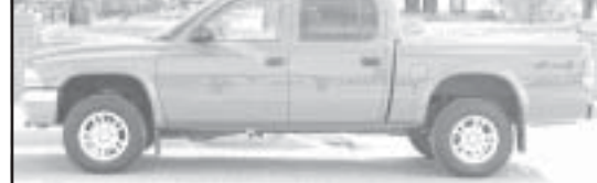
2003 DODGE DAKOTA QUAD CAB — 4x4, auto., SLT trim, extra clean, and only 24,000 miles.