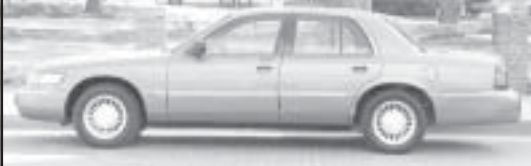
2000 MERCURY GRAND MARQUIS LS — Leather, automatic temperature control, traction control, SHARP! 78,000 miles.