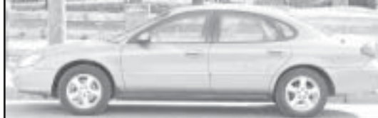
2004 FORD TAURUS — A standout 4 door with 24 valve V-6, leather, power moon roof, just 9,000 miles.