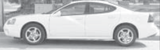
2004 PONTIAC GRAND PRIX GTP — Loaded! Moon roof, CD, alloy wheels, traction control, arctic white paint, and more, 13,000 miles. Also have 2004 GT model in metallic gold, also 13,000 miles.