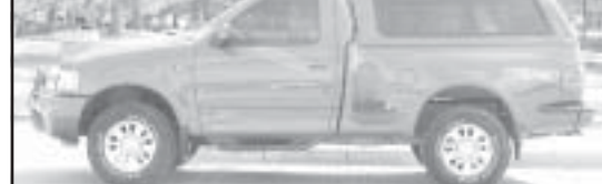
2001 FORD F150 — Sport side, short bed and fiberglass topper, only 32,000 miles on this red beauty.