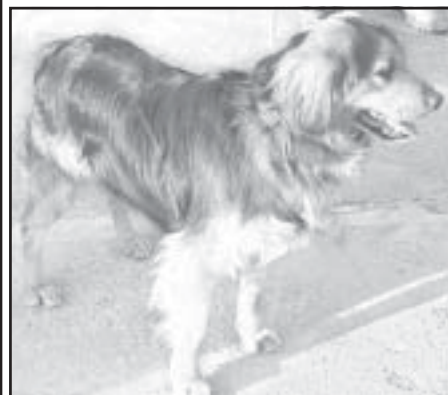
"Rosco" - Male Spaniel mix, 1 year old

Dogs will be started with obedience training and housebreaking. Vaccinations and spay/neuter will be completed. There will be an adoption fee required for each dog.