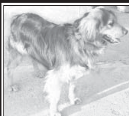
"Rosco" - Male Spaniel mix, 1 year old

Dogs will be started with obedience training and housebreaking. Vaccinations and spay/neuter will be completed. There will be an adoption fee required for each dog.