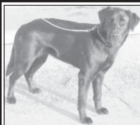
"Sue" - Female Black Lab, 2 years old

Dogs will be started with obedience training and housebreaking. Vaccinations and spay/neuter will be completed. There will be an adoption fee required for each dog.