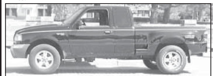
2002 FORD RANGER — XLT trim, 4 door super cab, 4.0 V-6, automatic 4x4, 6 cartridge CD stacker, alloy wheels and MORE! Only 15,200 miles on this beauty.