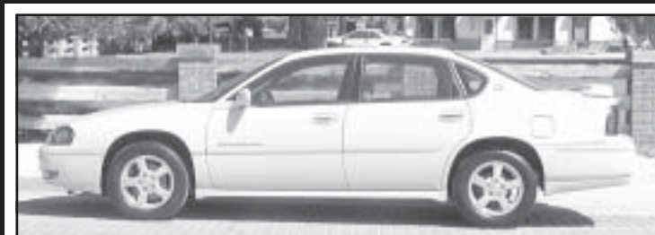
2004 CHEVROLET IMPALA — 4 door, LS trim, loaded with extras, including moon roof, leather interior, dual temperature controls, 3800 V-6, alloy wheels, rear spoiler, only 7,650 miles.