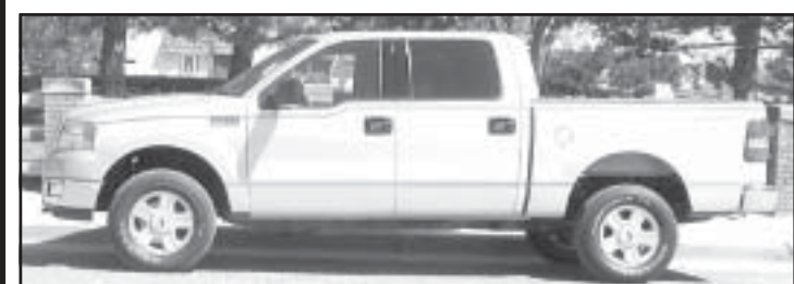
2004 FORD F150 4 DOOR SUPER CREW — With 5.4 V-8, automatic, 4x4, lots of extras - and super clean, 15,000 miles.