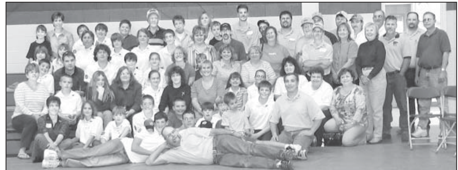
Norton County BB Gun Team fans are the best! Whenever a BB Gun Shoot is held, whether state or international, the Norton teams always receive the best fan support. Saturday was no exception as a very large crowd traveled to Manhattan where three Norton County Rotary BB Gun teams were competing in the Kansas State Jaycees BB Gun Championships.