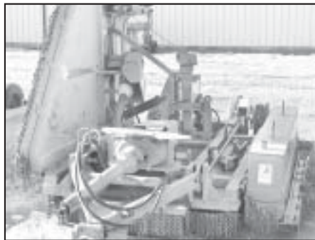
10' BUSHWACKER ROTARY MOWER