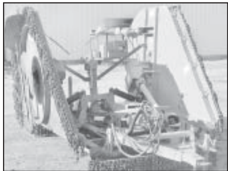
15' BUSHWACKER ROTARY MOWER