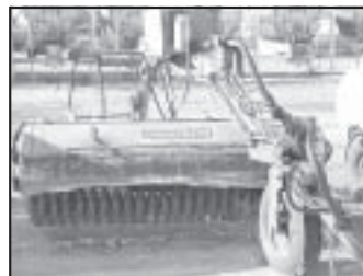
SWEEPSTER STREET SWEEPER