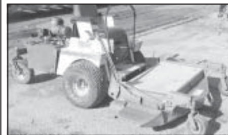
GRASSHOPPER 721 D 60" MOWER