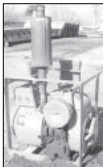
8 HP KOHLER GENERATOR