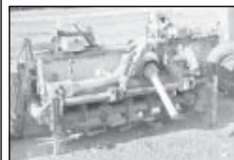
HOWARD 5' ROTAVATOR

ITEMS STILL COMING IN FROM THE AREA DOT SHOPS AT LISTING TIME!!