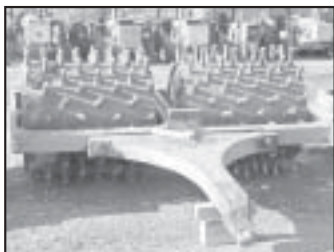
9' SHEEP FOOT ROLLER