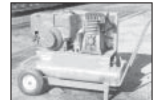
INDUSTRIAL AIR PORTABLE AIR COMPRESSOR