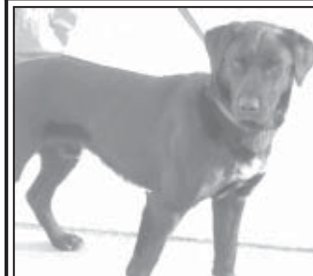
"Toby" - Male Black Lab 1-2 years old

Dogs will be started with obedience training and housebreaking. Vaccinations and spay/neuter will be completed. There will be an adoption fee required for each dog.