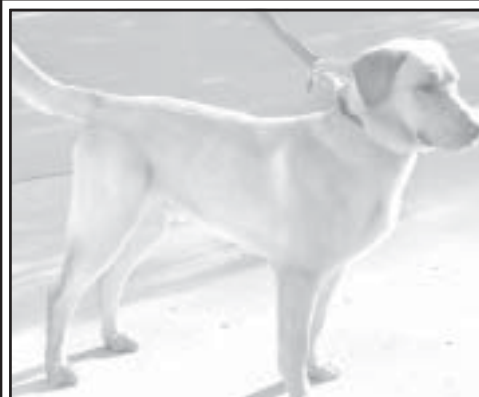
"Rowdy" - Male Golden Retriever Mix, 2 years old

Dogs will be started with obedience training and housebreaking. Vaccinations and spay/neuter will be completed. There will be an adoption fee required for each dog.