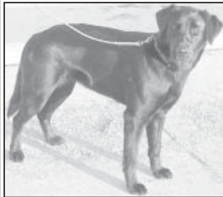
"Sue" - Female Black Lab, 2 years old

Dogs will be started with obedience training and housebreaking. Vaccinations and spay/neuter will be completed. There will be an adoption fee required for each dog.