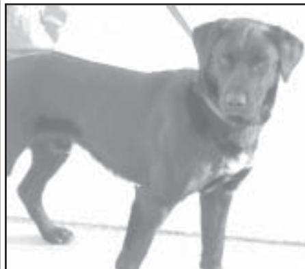
"Toby" - Male Black Lab 1-2 years old

Dogs will be started with obedience training and housebreaking. Vaccinations and spay/neuter will be completed. There will be an adoption fee required for each dog.