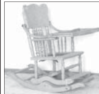
Wood High Chair Folds to Make Rocker (Needs Cane Seat)