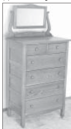
6-DRAWER DRESSER WITH MIRROR