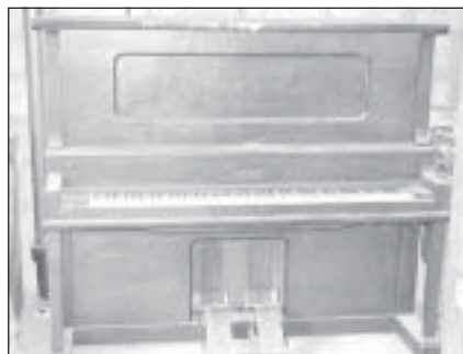
GULBRANSEN PLAYER PIANO