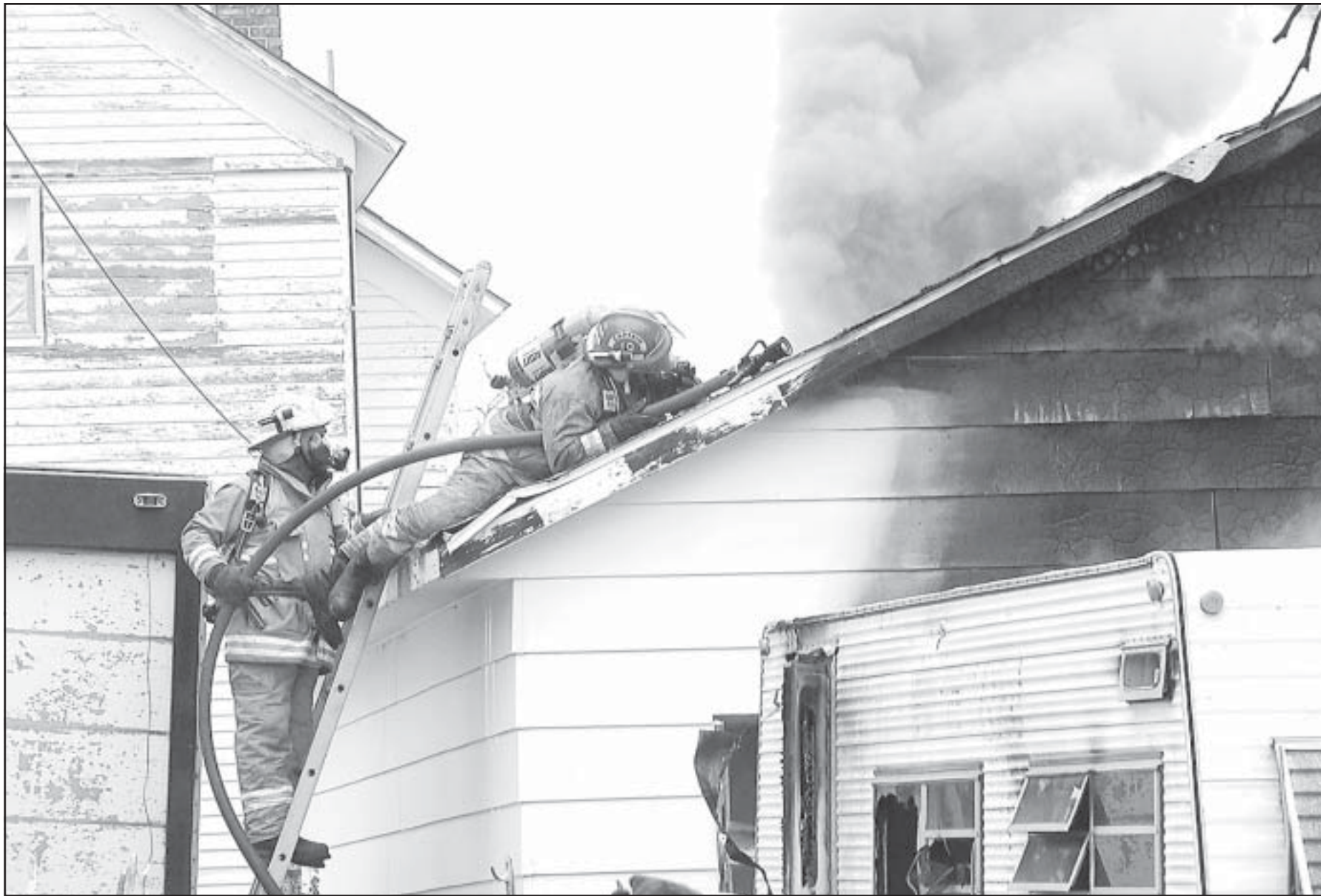
Norton firemen rushed (below) to get a blazing garage put out after a fire spread from a travel trailer Thursday afternoon. Firemen cut a hole into the roof (above) of the garage to shoot water at the fire from another angle.

Thank you, God, for your unending blessing. Teach us to be your stewards on earth of all you have entrusted to our care. Amen