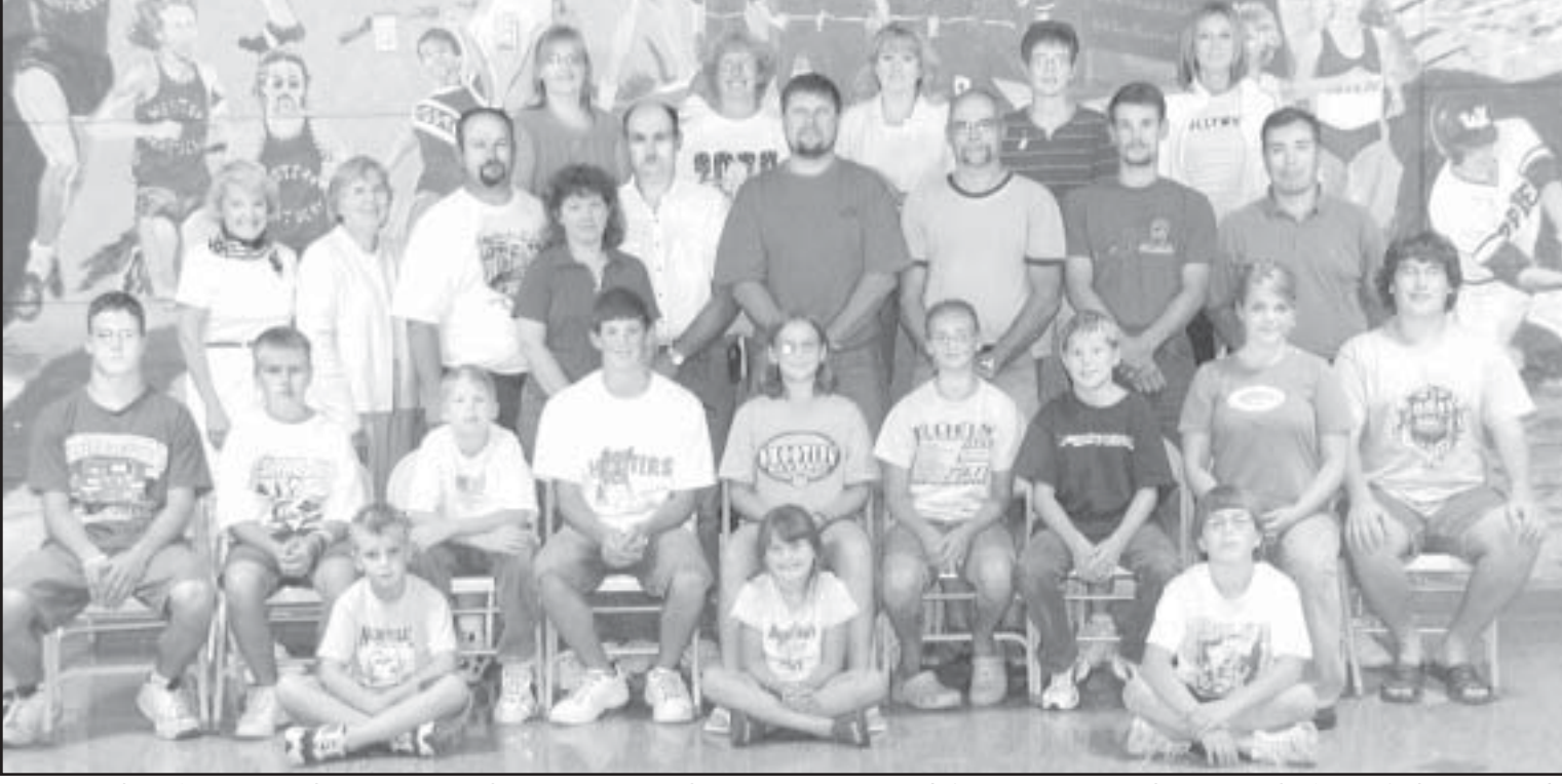
Norton Contingent—The Norton shooters, coaches, parents and fans pose at the completion of the Awards Ceremonies on Sunday evening. Norton follows the BB Gun Team wherever they shoot and always has the largest number of boosters.