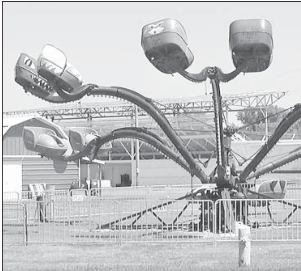
The giant octopus sits empty now. But, Monday night, when the carnival at the Norton County Fair opens, the lines will form as young and old await their turn on the big ride.

Additional taxes, surcharges and fees may apply, including a 56¢ Regulatory Cost Recovery fee and a 59¢ Telecom Connectivity fee. These fees are not taxes or government-required charges. Other surcharges may include federal and state mandated Universal Service Fund fees and a 911 fee of up to $1.94. Limited-time offer at participating locations. Requires service agreement, credit approval and approved handset. $200 early termination fee applies. Activation fees may apply. Other restrictions apply. Terms and conditions are available at Authorized Agent locations or www.alltel.com