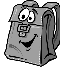
(4th, 5th & 6th Grade Band Students Also Purchase Band Books)