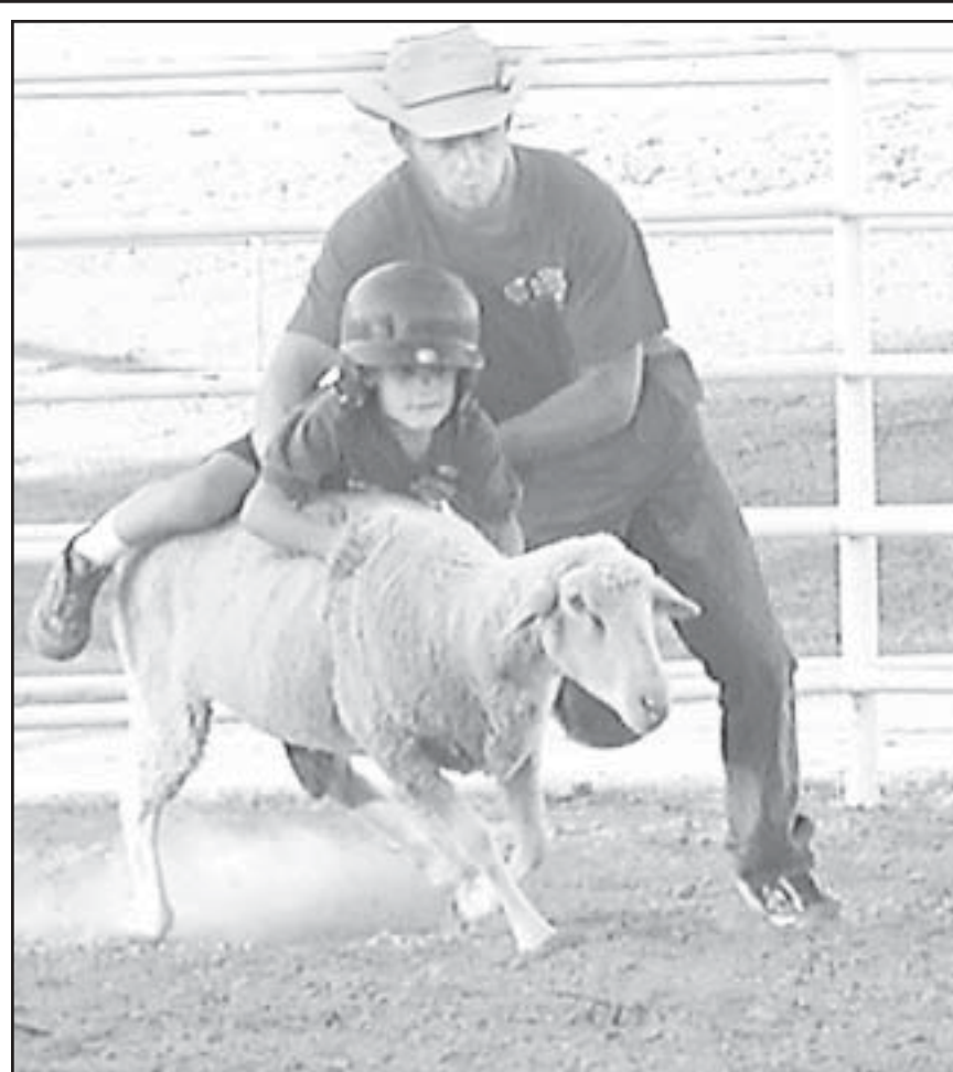
A helper at this year's McClain's Mutton Busting did a good job keeping the young riders from falling off.