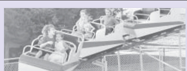
Fun at the Fair: Photos on Pages 6-7