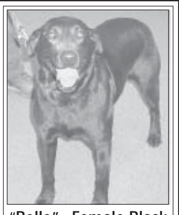
"Belle" - Female Black Lab Mix, 2-3 yrs. old