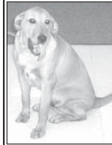
"Thor" - Male Yellow Lab, 10-12 months

Dogs will be started with obedience training and housebreaking. Vaccinations and spay/neuter will be completed. There will be an adoption fee required for each dog.