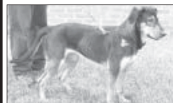
"Madison" - Female Hound Mix, 2 yrs. old

Dogs will be started with obedience training and housebreaking. Vaccinations and spay/neuter will be completed. There will be an adoption fee required for each dog.