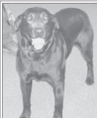
"Belle" - Female Black Lab Mix, 2-3 yrs. old