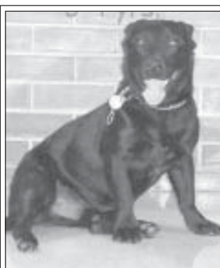
"Max" - Male Black Terrier, 3-4 yrs.

Dogs will be started with obedience training and housebreaking. Vaccinations and spay/neuter will be completed. There will be an adoption fee required for each dog.