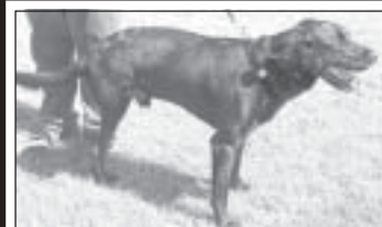
"Claude" - Male Black Lab, 5 yrs. old