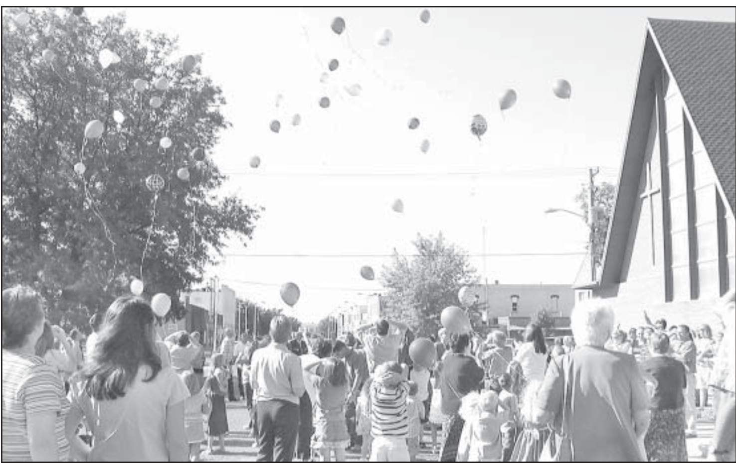
Sunday was Promotion Sunday at the Norton Christian Church. All the children in the Sunday School classes celebrated the event by releasing balloons before worship services.