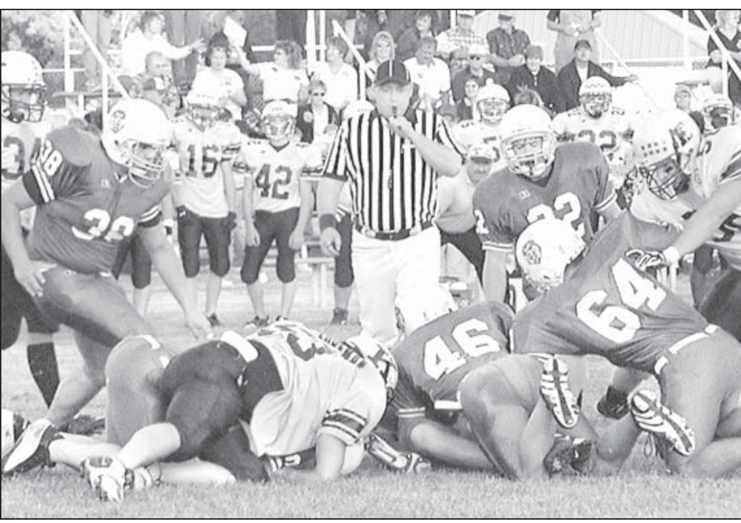
Northern Valley's Huskies and Kensington's Goldbugs scramble for a loose ball in Friday's Homecoming contest at Almena. The Huskies were within one touchdown