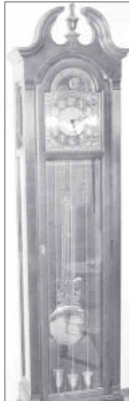
Mahogany Grandfather Clock (1 Year Old)

1979 Mercury Cougar - V-8, Auto., AC, 90,000 Miles