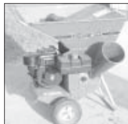
WW Grinder Inc. Renegade Wood Chipper 8 HP Briggs Engine-Nice

Antique Glass and Oak Showcase Mahogany Jewelry Chest 10 Gun Gun Cabinet China Hutch Oak Drop Leaf Table Coffee Tables (2) Oak Rockers Pine Wood Table Da-Vin-Ola Wind-Up Phonograph Master Craft Sofa Sleeper Master Craft Recliner End Tables (4) Blonde Wood Chairs Weslo Ex 12 Motorized Tread Mill Large Rest Recliner (Like New) Domestic Rotary Treadle Sewing Machine Hyde-A-Bed Couch (Nice) Floor Lamps Double Poly Sink on Stand Platform Rocker Older 3-Cushion Couch Ash Tray Holders Sandborn 1 HP Air Compressor (Needs Tank Repair) Kenmore Gas Grill (New/Full Propane Tank) Baldwin Orga-sonic Organ-2 Keyboards 5-Pedestal Plant Stands Rockwell 4" Jointer B&D 7 1/2" Band Saw Bench Top Drill Press 4 & 6 Drawer Dressers Wizard 5 HP Rotary Tiller Herring-Hall-Marvin Safe Co. Safe (20" w x 21" d x 40" h) Aldek & Upright 4' Aluminum Scaffolding- (at least 3 Base Units, some with Stabilizing Out Riggers)