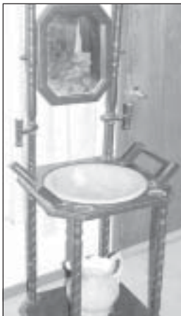
Mahogany Wash Stand

Auction Location: National Guard Armory, North Highway 283, Norton, KS Antiques - Collectibles - Household Furniture - Tools - Miscellaneous