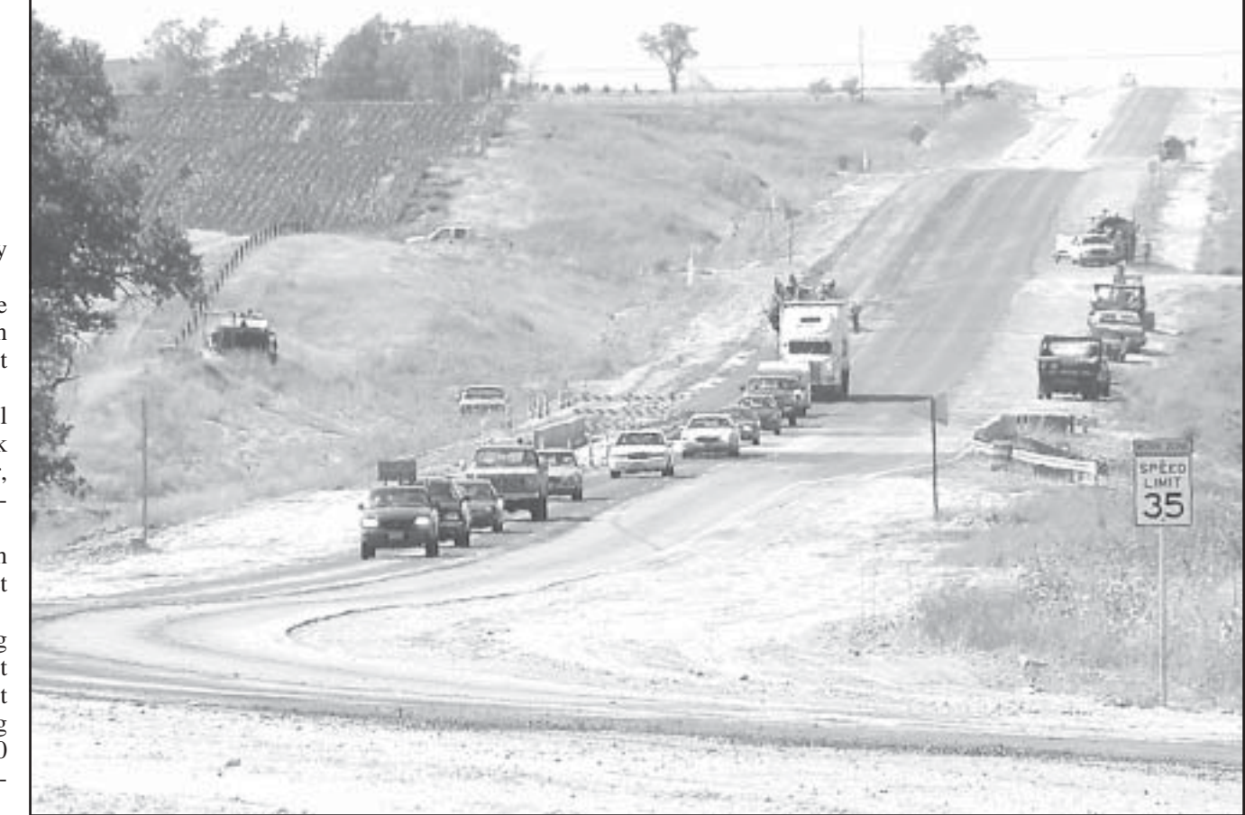
Travelers along U.S. 36 Highway west of Norton won't have much longer to wait until there is a break in construction. Right now, pilot cars are leading the lines of cars through. Photo

"Before, there was a three-foot paved (Continued on Page 5)