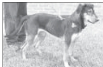
"Madison" - Female Hound Mix, 2 yrs. old

Dogs will be started with obedience training and house-breaking. Vaccinations and spay/neuter will be completed. There will be an adoption fee required for each dog.