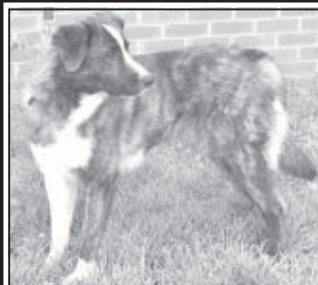
"Lady Bird" Female Boxer/ Border, 1-2 yrs.

Dogs will be started with obedience training and housebreaking. Vaccinations and spay/neuter will be completed. There will be an adoption fee required for each dog.