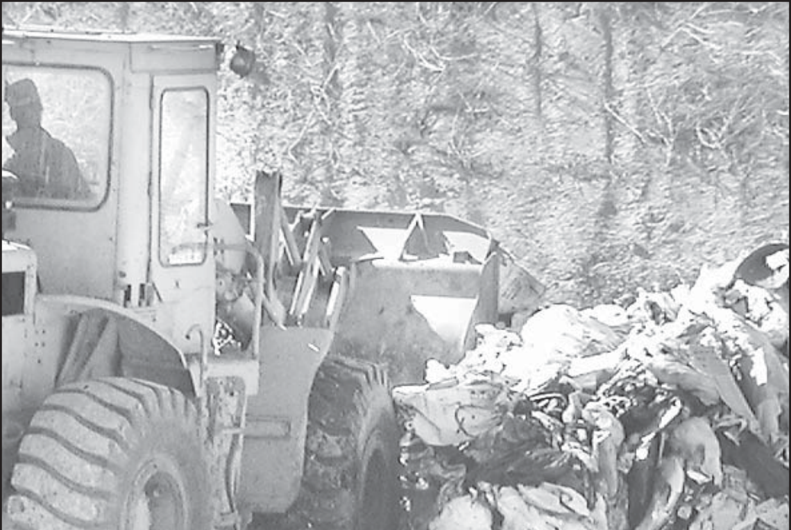
The Norton County Landfill is open for business. Once trash has been dumped, it is smashed by the bulldozer and covered with dirt.