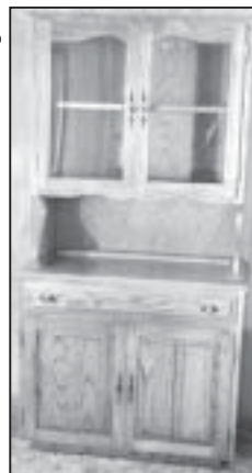
Small China Hutch Needlepoint Footstool

La-Z-Boy Motorized Lift Chair (3) La-Z-Boy Recliners (Nice) 3-Pc. 4 Poster Bedroom Set 3-Pc. 4 Poster Bedroom Set (Painted) Full Size Bed 3-Piece Bedroom Set Wood Dining Table & Chairs Round Dinette Table & Chairs 4 and 5 Drawer Dressers 3-Cushion Couch Vanities Love Seat Couch End Tables Roos Cedar Chest Single Bed Coffee Table Night Stands New Home Treadle Sewing Machine and Cabinet Glider Porch Swing Wicker Rocking Chair Oak Press Back Chair