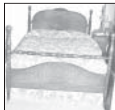
4 Poster Bed

Magic Chef 17.5 Cu. Ft. Refrigerator Corner Shelves Frigidaire 10 Cu. Ft. Upright Freezer Magazine Racks Entertainment Center Wood Plant Stands Kirby Ultimate Vacuum (1 Year Old) Double Tubs Swivel Rockers Small Kitchen Storage Cabinet Wood Cabinet Base Wood Cabinet Top